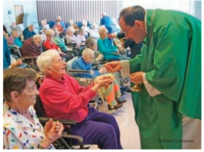
Archbishop LeGatt celebrates Mass at Foyer Valade

Q: Do you have a message for the faithful of the diocese?