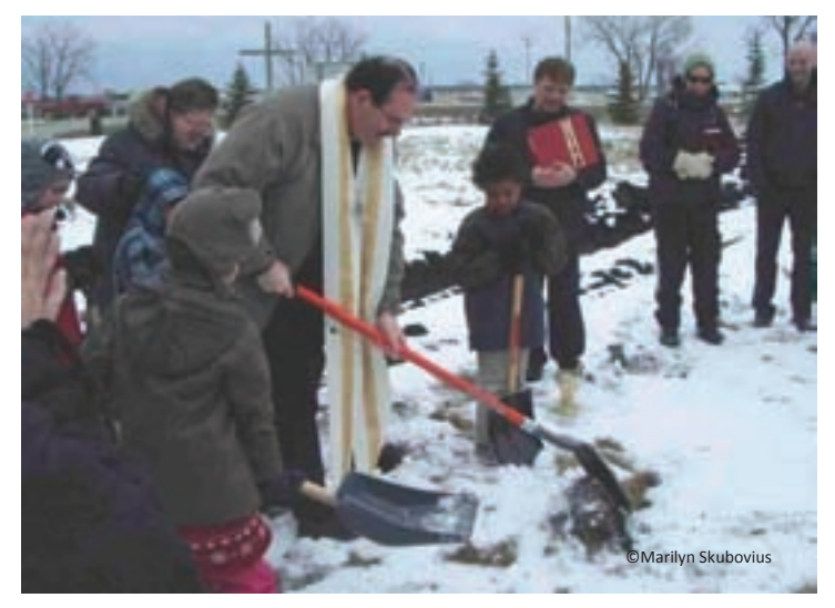
Sod turning ceremony for the new church in Morden