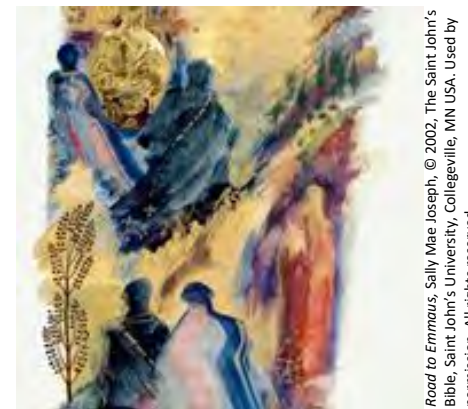
Road to Emmaus , Sally Mae Joseph, © 2002, The Saint John's Bible, Saint John's University, Collegeville, MN USA. Used by permission. All rights reserved.