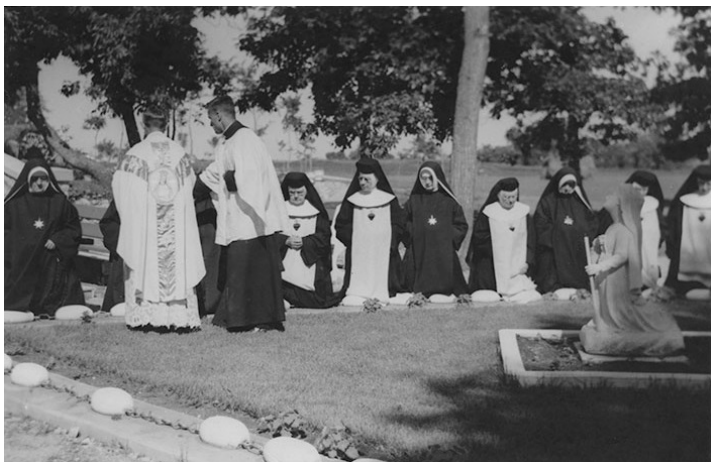
Marian devotions to the Oblate novitiate of St. Norbert in 1952.

In the half-century since the Council, a new balance has been established. We appreciate Mary and the saints, but with a new perspective. The saints and we all form a great family. And we all have our eyes set towards Christ.