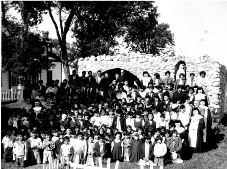
A Marian pilgrimage at Fort Alexander in 1957.

Definitely. In Brittany, in France, a pilgrimage is even called a Pardon! I'd go even further than that. In all the great spiritual traditions, we see a similar ritual being enacted. During the summer, when the Church of Saint Boniface has its pilgrimage to St. Malo, Indigenous people will be organizing many powwows.