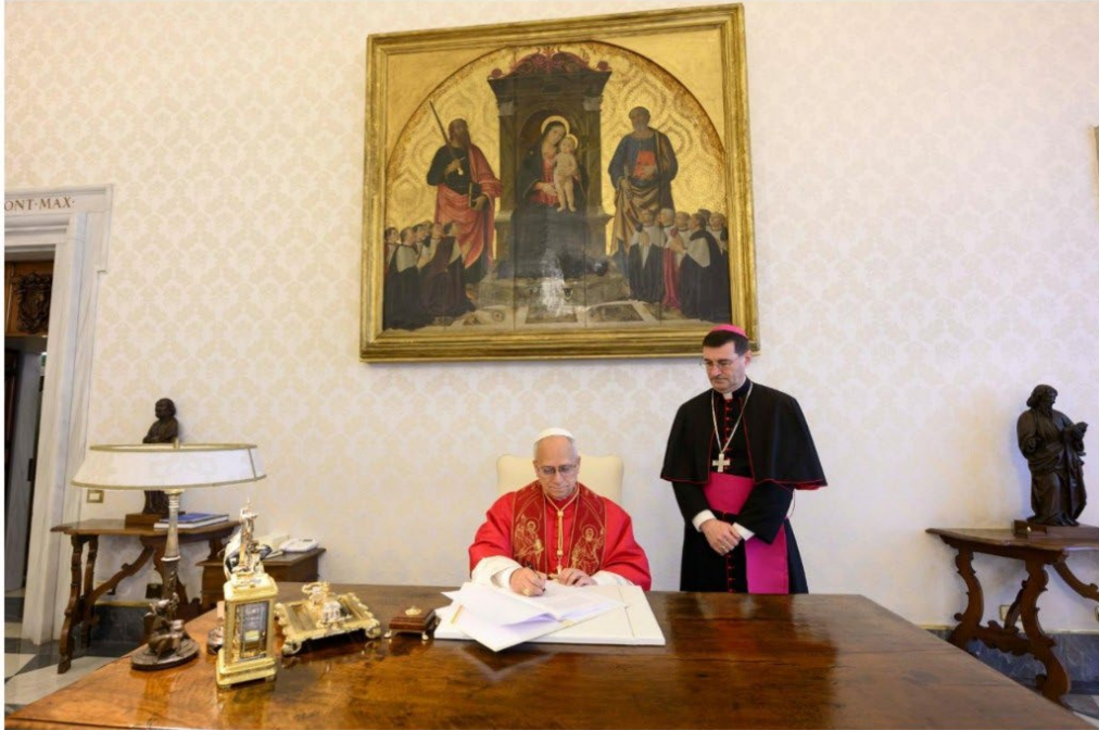
Pope Leo XIV signs "Magnifica humanitas"