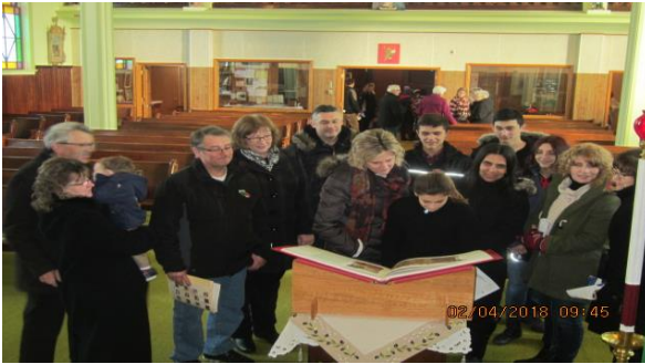
Parishioners of St. Gerard Majella Church