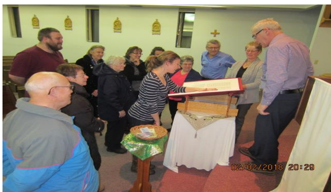
Parishioners in Saint John Berchmans Church, Holland

Many people came forward throughout the day to examine and pray with The Saint John's Bible. Many were in awe of this breathtakingly beautiful sacred work of art that offers the viewer rich symbolism that leads us to reflection and prayer.